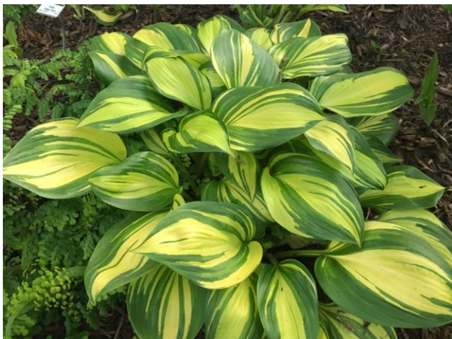
H. 'Rainbow's End' in the Schwartz Garden