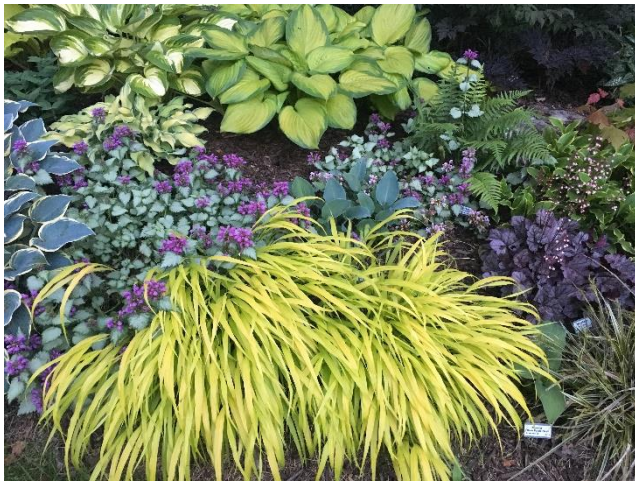
Golden Japanese Forest Grass in the Schwartz Garden