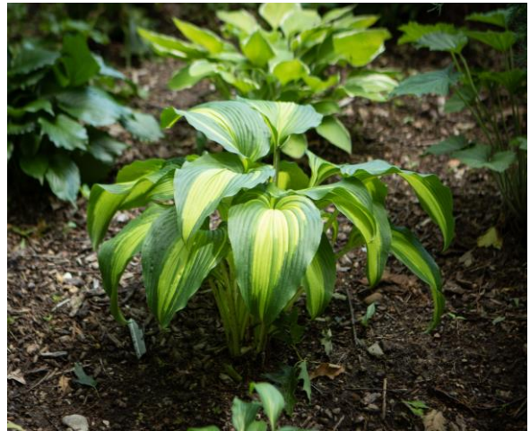
H. 'Hollywood Lights' in the Maitner Garden