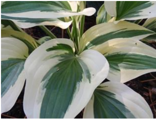
H. 'Sweet Innocence' in the Anderson Garden