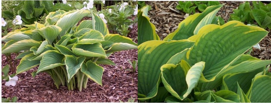
Hosta 'Gabriel's Wing'