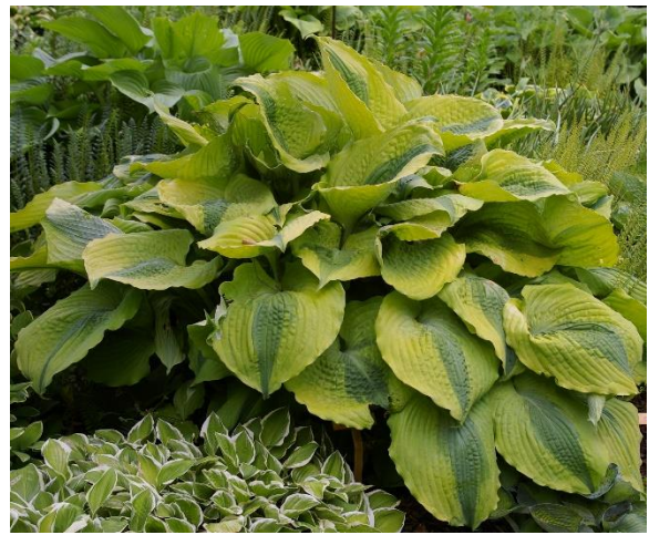
H. 'Goodness Gracious' in the Rawson Garden