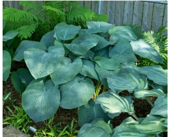
H. 'Big Blue' in the Sinke Garden